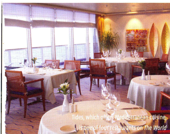
Tides, which offers Mediterranean cuisine, is one of four restaurants on The World