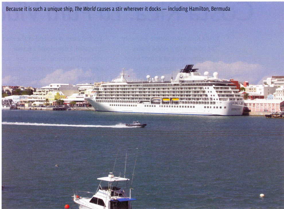
Because it is such a unique ship, The World causes a stir wherever it docks — including Hamilton, Bermuda

While these places were all in use, the busiest area was the fitness center and spa — the only Banyan Tree Spa located on a ship. (Tip: book appointments well ahead to avoid disappointment.) It seems that residents use the time at sea to work out, catch up, and plan for the next port. Some also try to shed a few pounds by choosing the South Beach Diet dishes that are offered on every menu. I, however, found it hard to resist the numerous indulgent options.