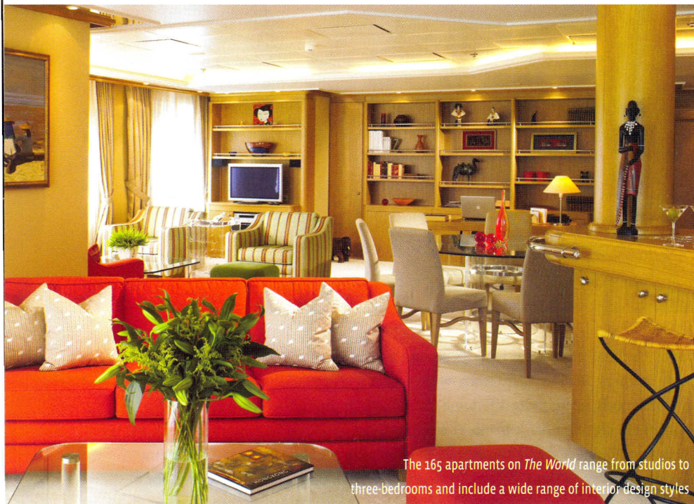
The 165 apartments on The World range from studios to three-bedrooms and include a wide range of interior design styles