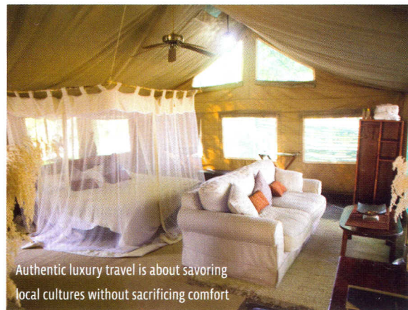
Authentic luxury travel is about savoring local cultures without sacrificing comfort

Like other authentic luxury travelers, I want to explore the