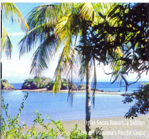
Islas Secas Resort, a hidden gem on Panama's Pacific Coast

I would rather spend an inordinate amount of time learning about the destination, planning the trip, and booking hotels — and then travel solo or a deux with my husband or a friend. To take the pain out of early-morning departures, I'm inclined to stay at airport hotels — the Fairmont Hotel at Vancouver Airport being the best of these. ( www.fairmont.com/vancouverairport )