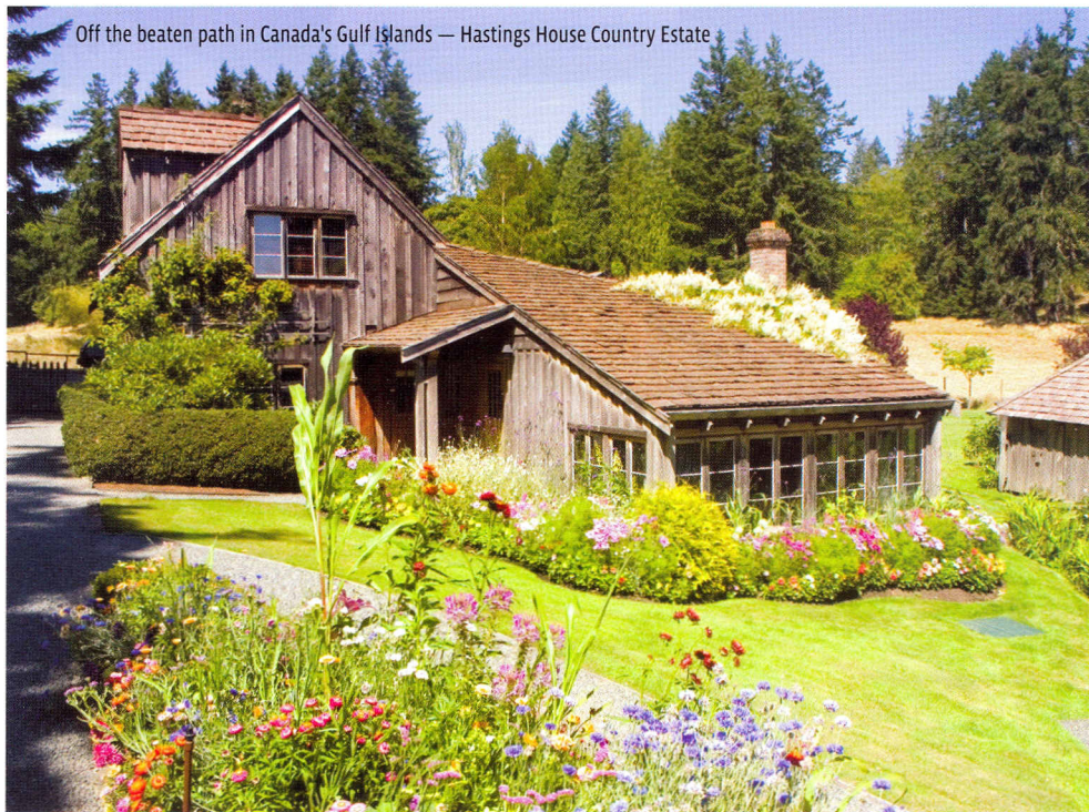
Off the beaten path in Canada's Gulf Islands — Hastings House Country Estate

Every traveler has his/her own idea about what constitutes a luxury experience — and yours might be quite different from mine. However, I bet we agree on one thing: traveling in economy class is not luxurious.