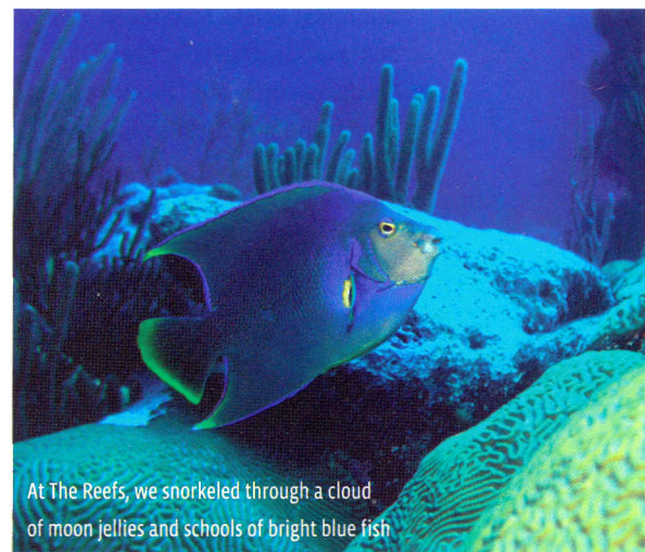
At The Reefs, we snorkeled through a cloud of moon jellies and schools of bright blue fish

As luck would have it, the hotel's Serena Spa was very near our quarters and our favorite of the resort's three restaurants, Ocean Echos, was also close by. Many guests made sorties from the resort to play golf, go horseback riding, and ride scooters around the island.