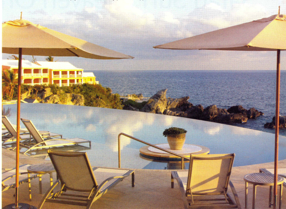
Residents of The Reefs Club enjoy their own infinity pool that appears to spill into the Atlantic Ocean

laundry facilities, but we really appreciated our lovely home and its amenities — including a private Jacuzzi on the deck.