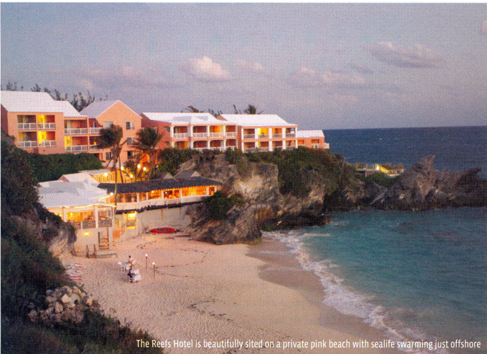
The Reefs Hotel is beautifully sited on a private pink beach with sealife swarming just offshore