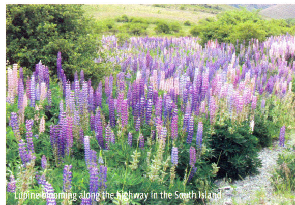
Lupine blooming along the highway in the South Island

especially if you stay on the third floor and are upgraded to the Hilary Clinton Suite, as we were. Food and service were terrific, too.” (Author’s note: The George closed briefly after the February 22 earthquake, but has re-opened. In fact, all of NZ is open for business except the very center of Christchurch.) ( www.thegeorge.com )