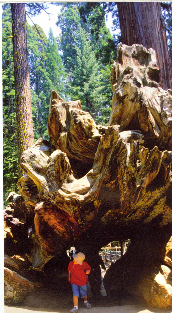
The Fallen Monarch Tree in Kings Canyon National Park makes a great tunnel for kids