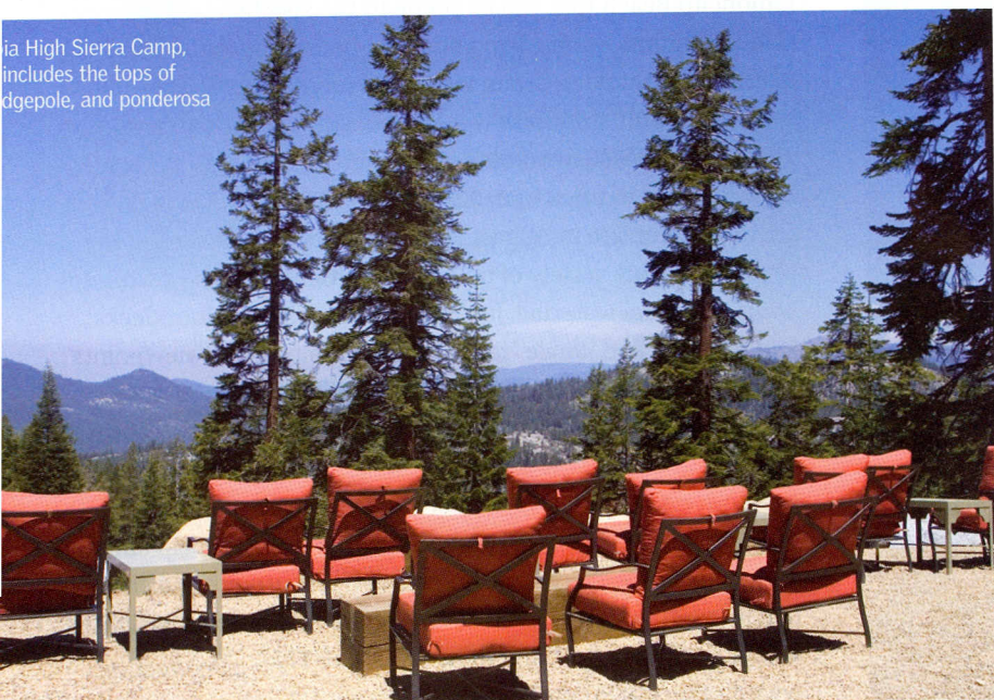
Sequoia High Sierra Camp includes the tops of lodgepole, and ponderosa

with a black bear, which luckily didn't find them very interesting. Other guests had walked to Lookout Peak just a few miles from camp and spent the afternoon engaged in a hot Monopoly game. A few people had walked back to their cars and explored the national parks by road.