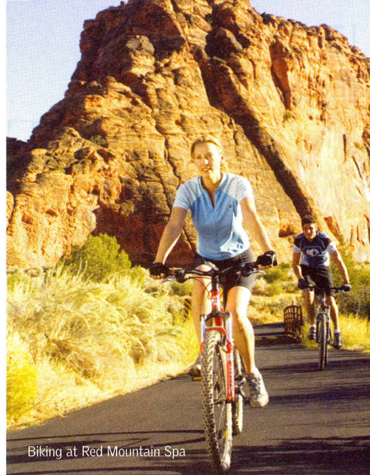
Biking at Red Mountain Spa