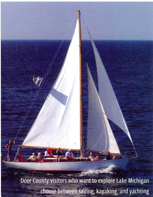
Door County visitors who want to explore Lake Michigan choose between sailing, kayaking, and yachting