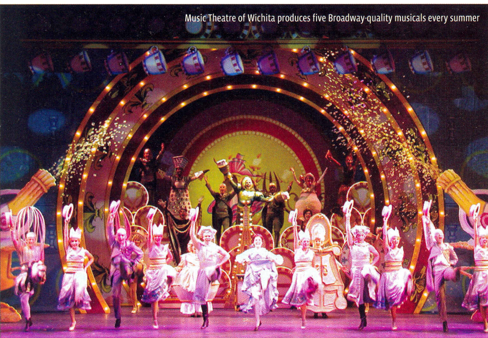
Music Theatre of Wichita produces five Broadway-quality musicals every summer