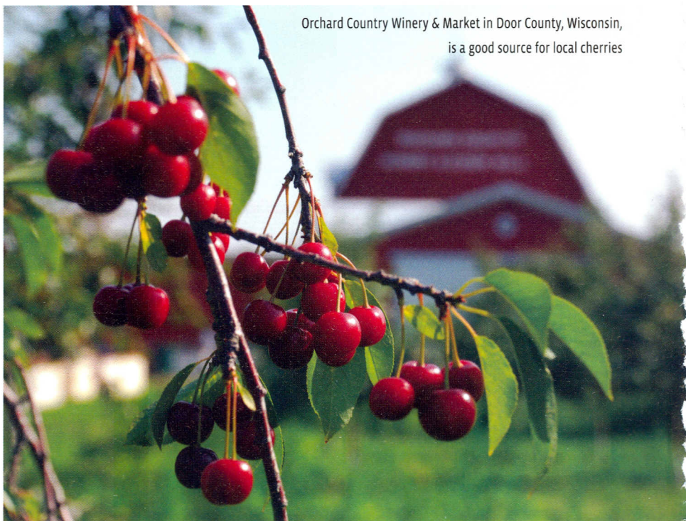
Orchard Country Winery & Market in Door County, Wisconsin, is a good source for local cherries

Thanks to the foresight and generosity of Cummins' founder, Columbus boasts buildings designed by, among others, Eero Saarinen, I. M. Pei, Robert Venturi, Cesar Pelli, and Richard