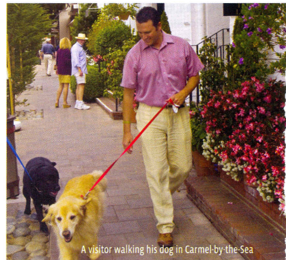
A visitor walking his dog in Carmel-by-the-Sea

When you’re ready to venture further afield, Carmel has plenty of pet-friendly hotels, restaurants, shops, and galleries. In addition, dogs can run freely on the community’s mile-long beach. At the Cypress Inn, man’s best friend is provided blankets, beds, bowls, and biscuits. The Forge in The Forest restaurant offers a Dog Pound menu (as well as great food for humans), and at Porta Bella waiters bring pups water in a Champagne bucket. ( www.seemonterey.com )