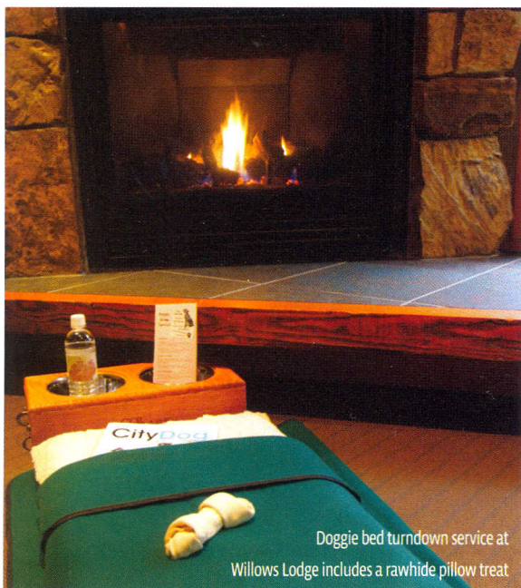
Doggie bed turndown service at Willows Lodge includes a rawhide pillow treat