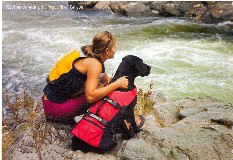
Best friends rafting the Rogue River Canyon

If you’ve never traveled with a pet, Loews Coronado Bay Resort would be a good first experience. The Loews Loves Pets program applies to any domesticated household pet, regardless of weight or breed. Room service includes roasted salmon for fussy felines and grilled filet and rice for canines. You and your dog could learn to surf at the hotel’s Su’ruff Camp, while kitty enjoys in-room amenities including toys, catnip, and a scratching pole. ( www.loewshotels.com )