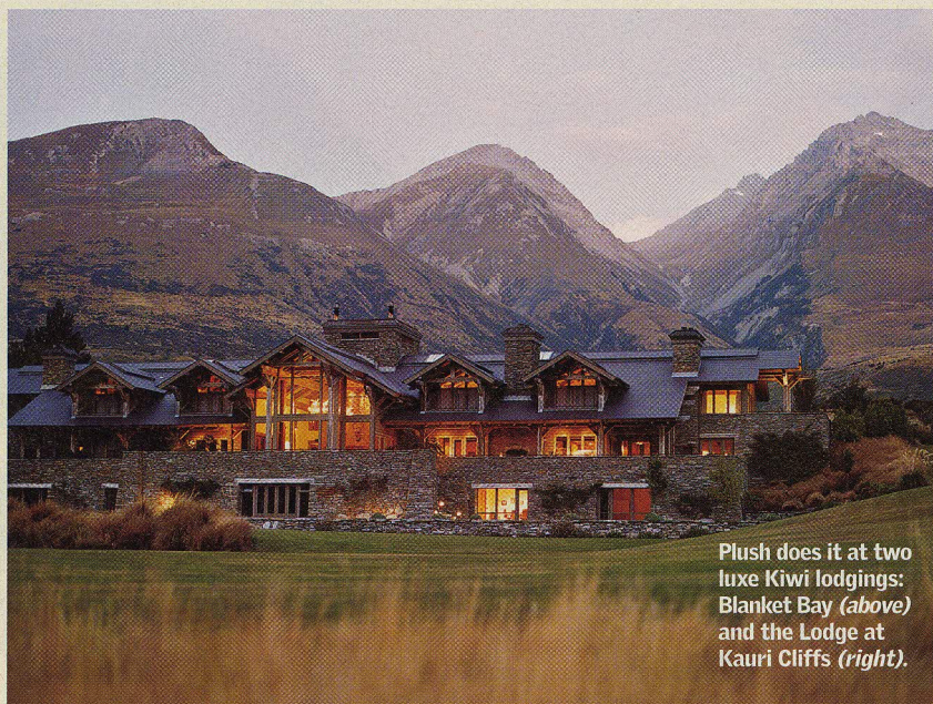
Plush does it at two luxe Kiwi lodgings: Blanket Bay (above) and the Lodge at Kauri Cliffs (right).