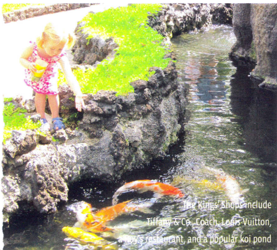
The King's Shops include Tiffany & Co., Coach, Louis Vuitton, and a popular koi pond