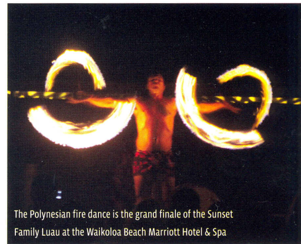
The Polynesian fire dance is the grand finale of the Sunset Family Luau at the Waikoloa Beach Marriott Hotel & Spa

I would have lingered longer, but we wanted to be at Huggo's On the Rocks — a nearby waterfront restaurant — in time to watch the sunset. This open-air spot offers live entertainment nightly