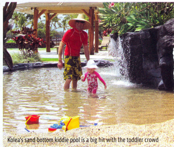
Kolea's sand-bottom kiddie pool is a big hit with the toddler crowd

When we arrived, the snorkel gear was ready and waiting, the crib was set up — and I was pleasantly surprised to find lots of beach toys, a very well equipped kitchen, and an outdoor wet bar and gas barbecue.