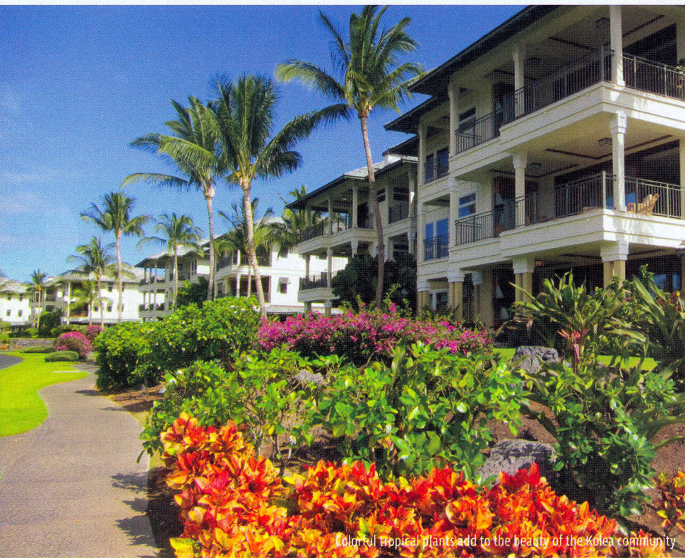
Colorful tropical plants add to the beauty of the Kolea community

Kolea turned out to be the perfect base for enjoying all things Hawaiian. Our first night we walked over to the Waikoloa Beach Marriott and enjoyed their Sunset Family Luau. Here, keiki (children) were given a hula lesson, watched coconut husking, and took turns strumming a ukulele. This was a traditional luau — complete with pig and veggies cooked in an imu (underground oven) — and we all enjoyed the feast, as well as performances of Polynesian