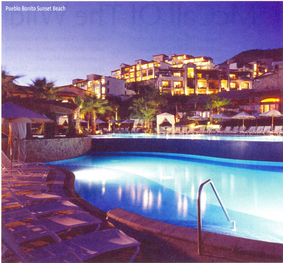
Pueblo Bonito Sunset Beach

the Pacific. It's also possible to see migrating gray whales from this attractive perch. In any case, "whale margaritas" are the house specialty. ( www.finisterra.com )