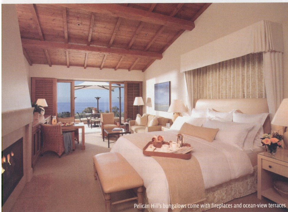
Pelican Hill's bungalows come with fireplaces and ocean-view terraces

Speaking of free, I was very impressed to learn that Pelican