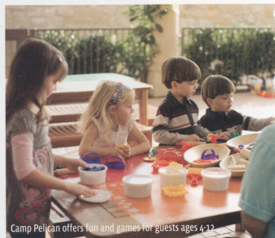
Camp Pelican offers fun and games for guests ages 4-12

Siblings, cousins, and friends ages 4-12 can play at the resort's Camp Pelican under the