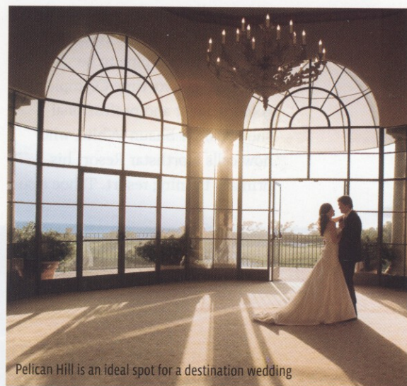
Pelican Hill is an ideal spot for a destination wedding

Gelato is another specialty of the house — made in a special lab and served at the Gelato Café. The chef also makes his own olive oil on the premises. Guests are invited to the pressing, which takes place every October.