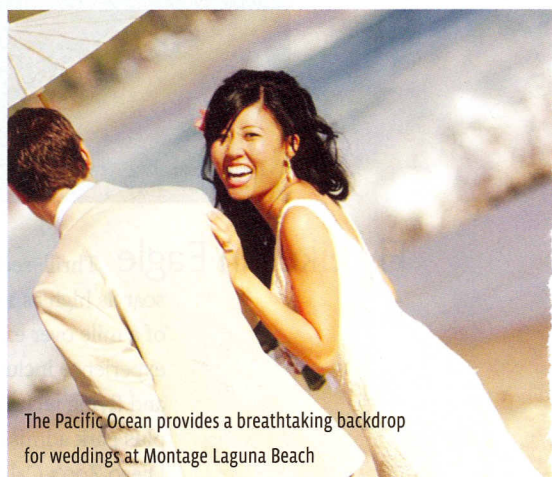
The Pacific Ocean provides a breathtaking backdrop for weddings at Montage Laguna Beach

You can easily get legally married in Australia, especially if you