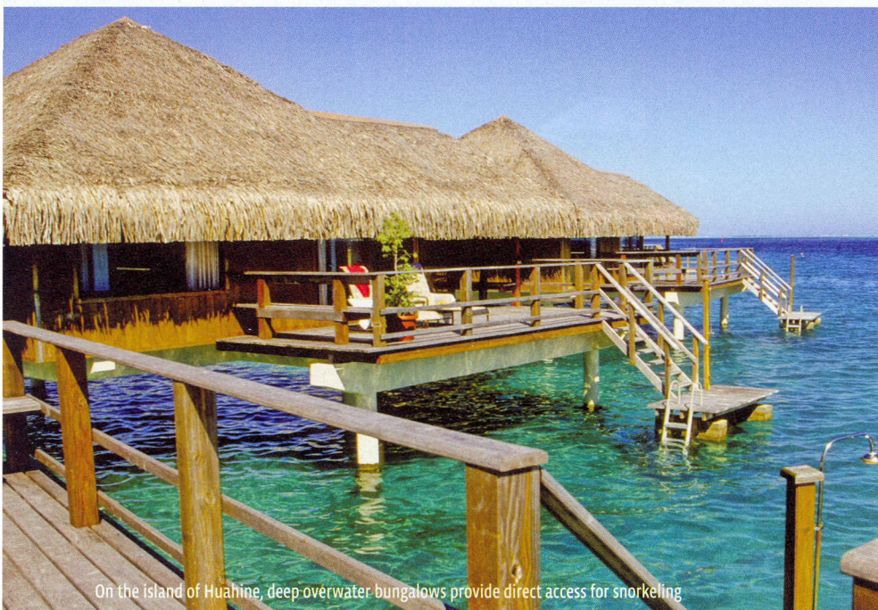
On the Island of Huahine, deep overwater bungalows provide direct access for snorkeling

That would be the case in French Polynesia, which requires a 30-day residency. However, you could go to Huahine, my favorite island, and enjoy a symbolic Tahitian wedding ceremony on the beach at Te Tiare Beach Resort. Dressed in traditional pareos and adorned with flowers, the bride and groom are serenaded with chants and songs of Polynesia. My advice: reserve one of the deep overwater bungalows for the best sunset views. ( www.tetiarebeachresort.com )