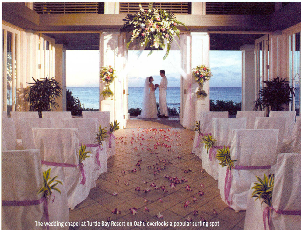
The wedding chapel at Turtle Bay Resort on Oahu overlooks a popular surfing spot