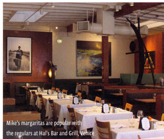
Mike's margaritas are popular with the regulars at Hal's Bar and Grill, Venice

The focal point of the leafy hideaway is a rose-shaped fountain, with each petal inlaid with broken pieces of blue and