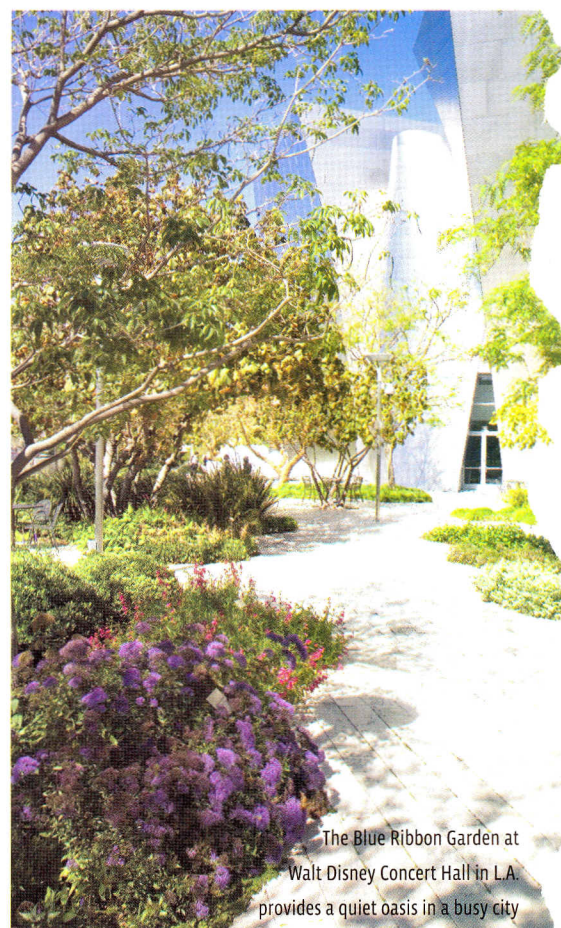
The Blue Ribbon Garden at Walt Disney Concert Hall in L.A. provides a quiet oasis in a busy city