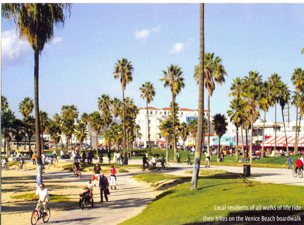
Local residents of all walks of life ride their bikes on the Venice Beach boardwalk

Another "find" of ours is the Japanese American National Museum in Little Tokyo. I like it because it's small enough to feel intimate and large enough to contain significant and meaningful exhibits. Here, individual journals, old photographs and documents, and personal belongings tell the