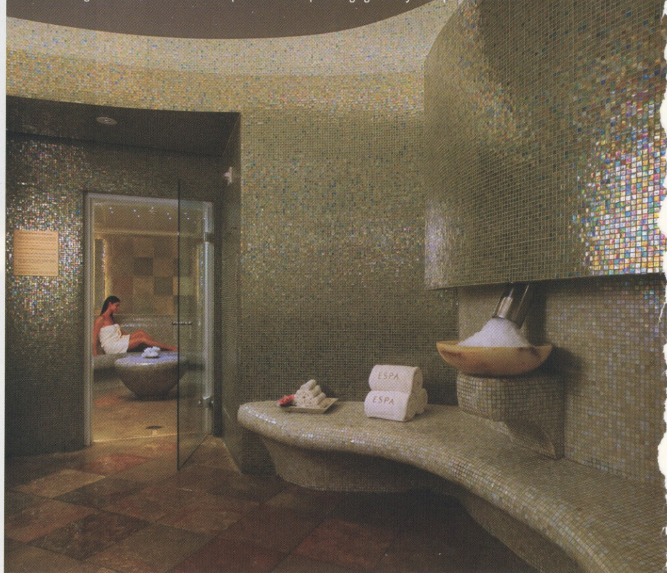
The colored lights in the steam room at Acqualina's ESPA spa change gradually and open the chakras

the Stress Releasing Abyhanga, which I first experienced at Ananda Spa in the Himalayas. The oil poured over my third eye (forehead) made my hair shiny and my skin retained a moist glow for at least a week.