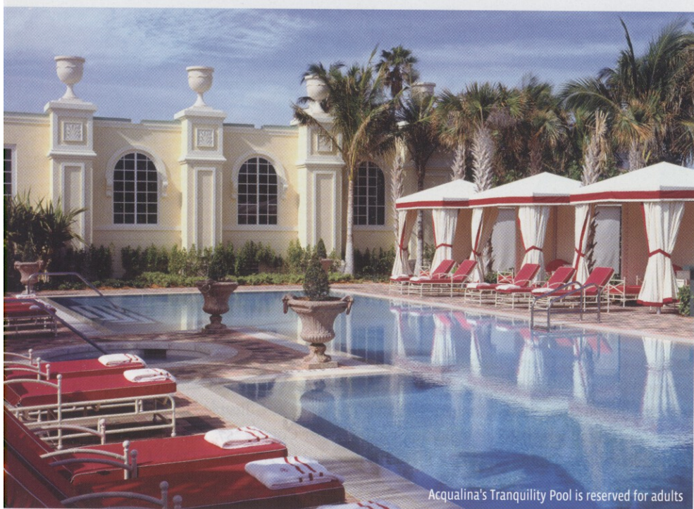
Acqualina's Tranquility Pool is reserved for adults

Even though I wasn't shopping, I loved watching the 30-something European-model-like moms >>