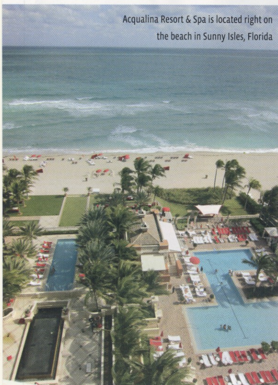
Acqualina Resort & Spa is located right on the beach in Sunny Isles, Florida