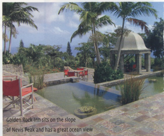
Golden Rock Inn sits on the slope of Nevis Peak and has a great ocean view

An avenue of towering palms leads to a picture-perfect beach complete with hammocks, chaise lounges, and umbrellas. Nearby, the swimming pool, hot tub,