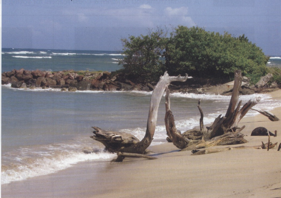
The Atlantic Ocean washes sculptured driftwood onto the Nisbet Plantation beach

hikes, bike tours, camping trips, and bike rentals. Email greenedge2011@hotmail.com or find Reggie on Facebook at Nevis Adventure Tours/GreenEdge Bike Shop.